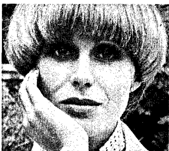
JOANNA LUMLEY: changing fashion.

But beneath the comedy Pam is a serious worker for Jewish causes.