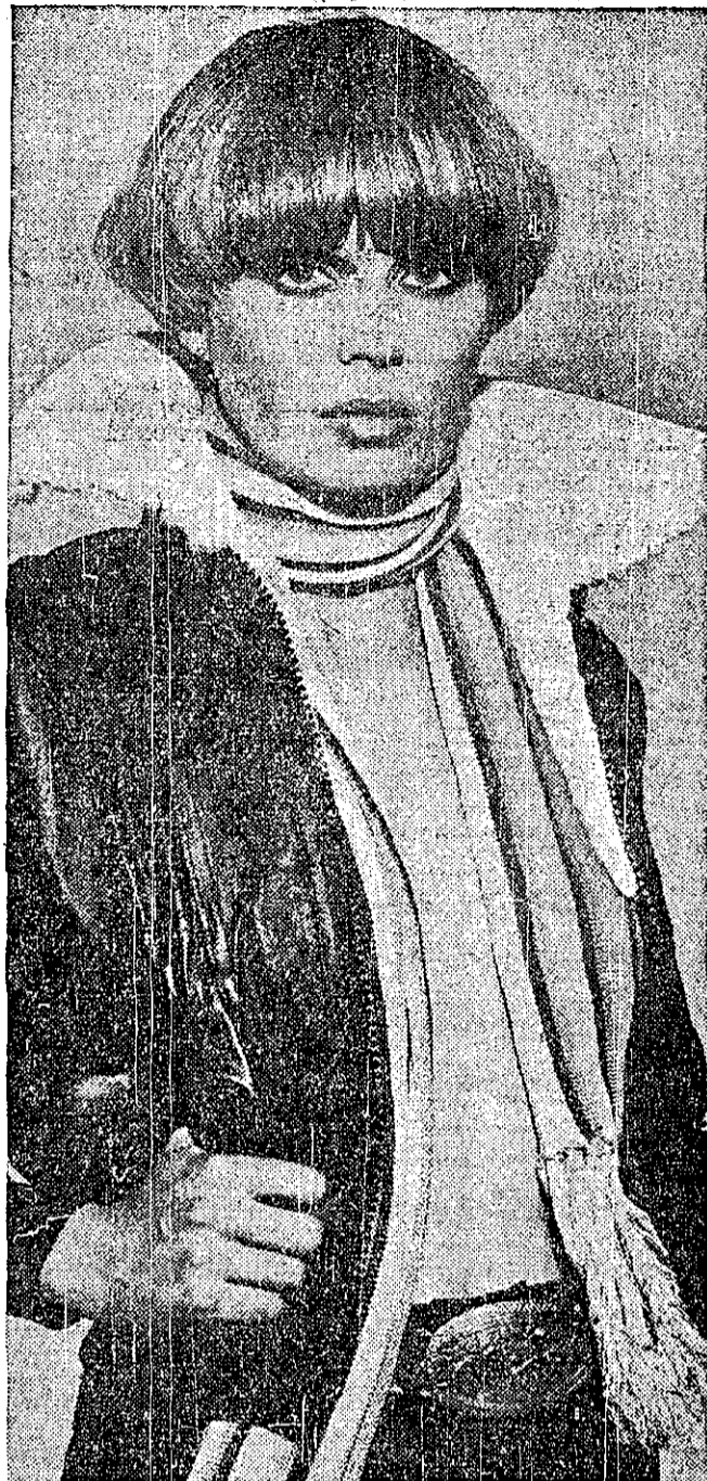
JOANNA LUMLEY—"I faint at the sight of blood."

"You know the sort of thing. I became that pilot, and in acting out my fantasies, I was having my first taste of what it was like to 'perform'." "But of course, you're right," she said. "The first professional work I did was as a model. I don't know why, I suppose because I'm basically lazy, and I thought that modelling would be easier, which, in a sense, it is. "If you've got the right physical equipment, you're three-quarters of the way there. On the other hand, it's quite difficult too. When I first became a model, round about 1965, the word 'model' had some rather unfortunate connotations. The Christine Keeler case was in full swing, and she and Mandy Rice-Davies also called themselves models. "Well, need I say more? "when I told my father I was going to be a model, his hair-line receded about 8in from